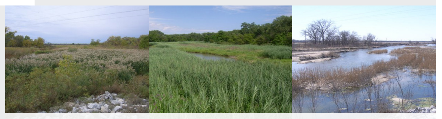
L-R: Before, during and after the Platte River Riparian Project.

Increase urban water supplies, states' compact commitments, water conveyance, wildlife habitats, tourism and recreation. Protecting infrastructure, by minimizing flooding and fire.