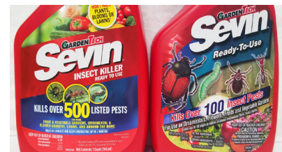
Figure 1. Product labels often look very similar even when the ingredients change. On the left is the product containing zeta-cypermethrin; the one on the right contains carbaryl.

Resources include the 10-page Guide document, a condensed set of guidelines for both farmers and seed treaters, checklists and helpful videos.