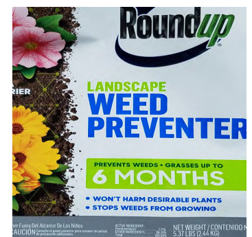
Figure 2: This Roundup product contains the herbicide pendimethalin instead of glyphosate.