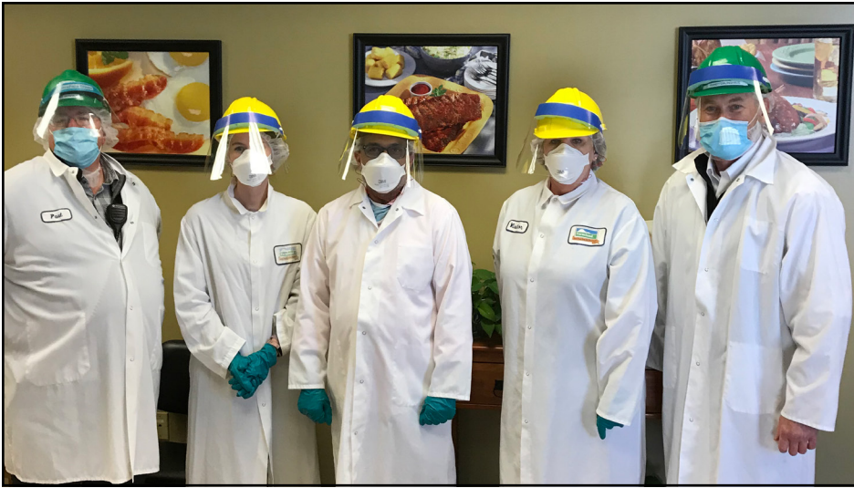
The Global Center for Health Security team conducted site visits to gather information from meat processing facilities.