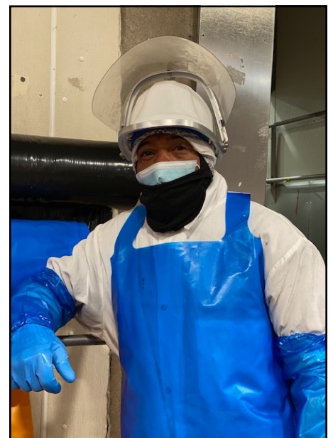
JBS employees followed guidance on universal mask wearing, amongst other best practices.