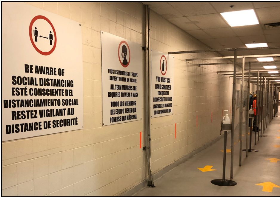
Translated signage and plexiglass barriers were installed at a JBS meat processing plant.

Ireland said that even some of the common best practices didn't come without challenges. Installing plexiglass barriers in a facility built in 1965 meant finding creative ways to install brackets and hangers to secure them. The use of masks needed to be encouraged beyond just the facility which meant wearing them in other public places or even carpooling. Conducting initial screenings upon entering the facility needed to go beyond temperature checks.