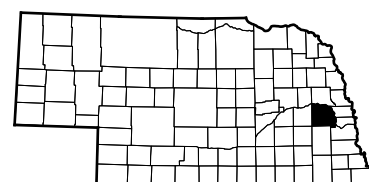
County Location Map

Nebraska Department of Agriculture Bureau of Plant Industry - Pesticide Program Box 94756 Lincoln, NE 68509-4756 (402) 471-2394 (pesticide labels and regulations)