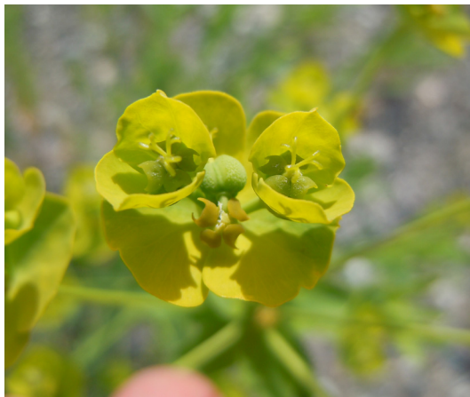
Each cyathium is subtended by 2 yellowish heart-shaped bracts and can produce 3 seeds.

In 1923, a botanical survey found this plant in York County. Since that time, it has been confirmed in 82 counties in Nebraska. Landowners and producers spend millions of dollars each year to control leafy spurge. This plant competes for water and nutrients while depleting grass and forage, which is utilized by livestock, wildlife, and recreationists. We can all do our part by controlling leafy spurge infestations or by reporting uncontrolled infestations to your local county noxious weed control authority.